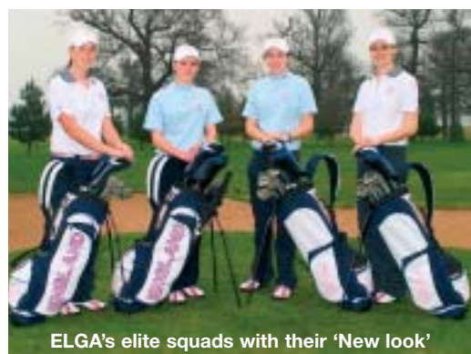
ELGA's elite squads with their 'New look'

Phone for your mail order brochure today! Quote code G5ELGA